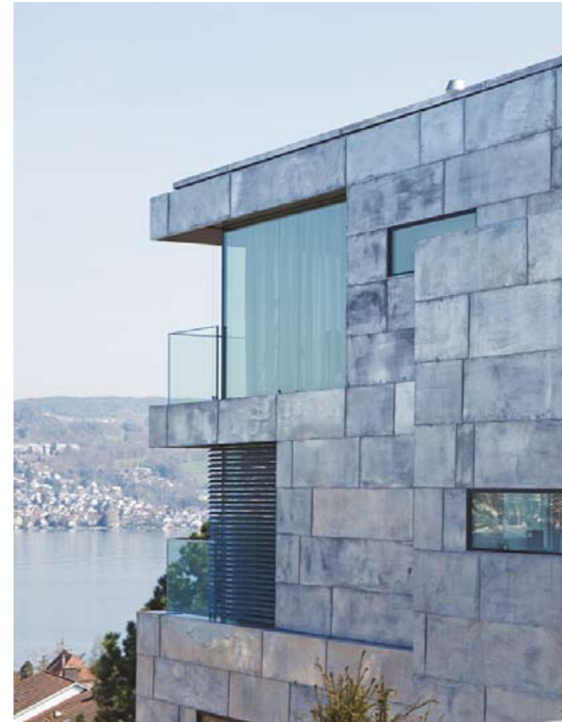
↑ | View towards lake ↓ | Detail drawing façade