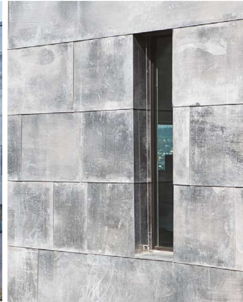
↑ | Detail copper sheets ↓ | Detail west façade