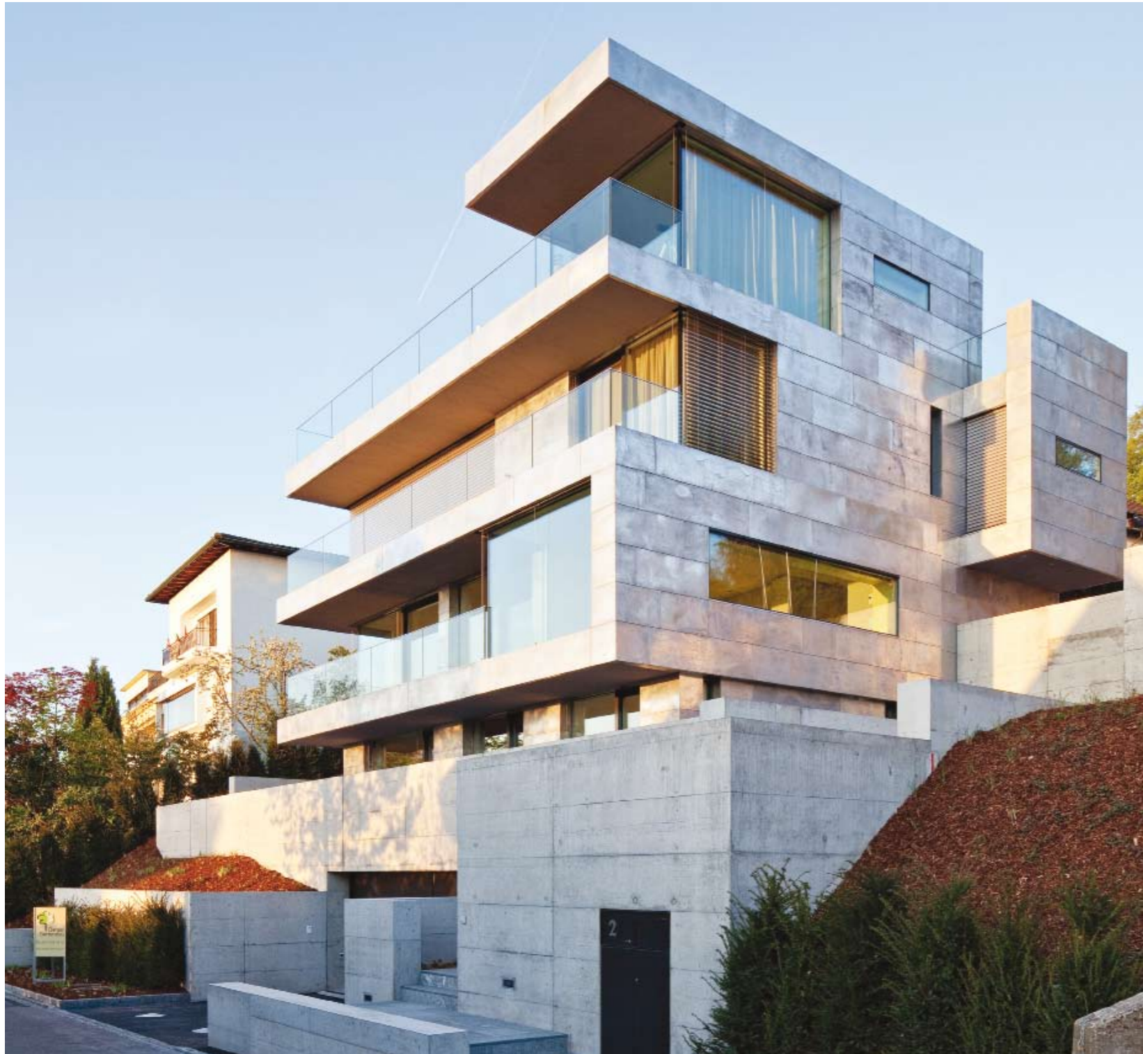
↑ | View from lake

Address: 8803 Rüschlikon, Switzerland. Client: private. Completion: 2010. Building type: living. Other creatives: Scherrer Metec AG Zurich (façade systems).