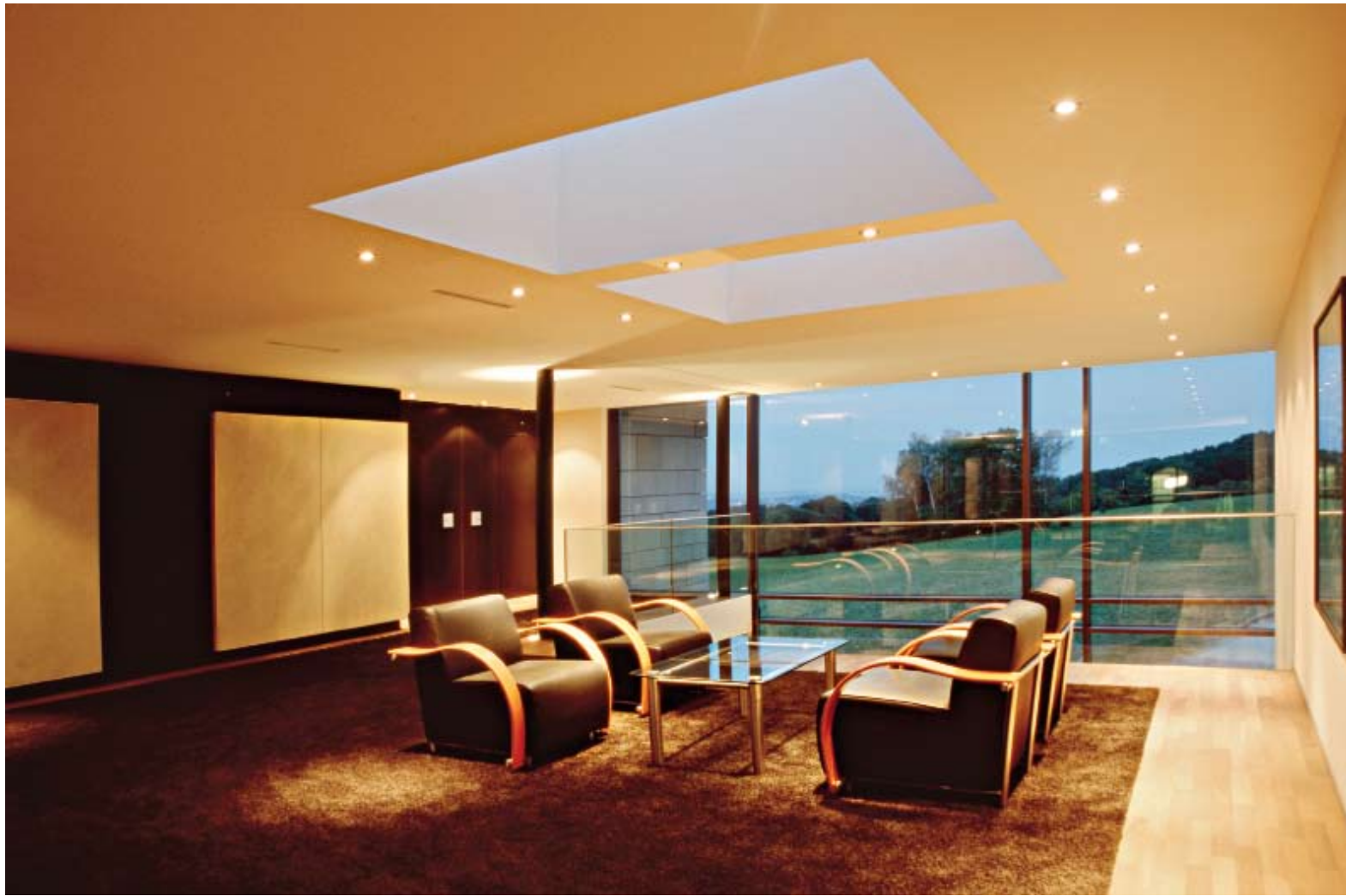
↑ | Foyer ↓ | Section